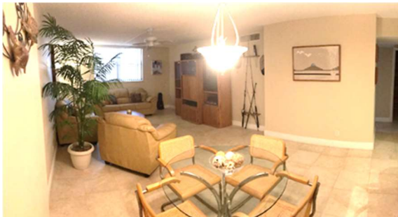
Family Room and Dining Room